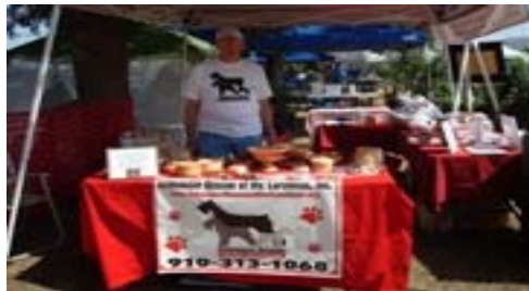
Paw Jam in Wilmington, N.C.