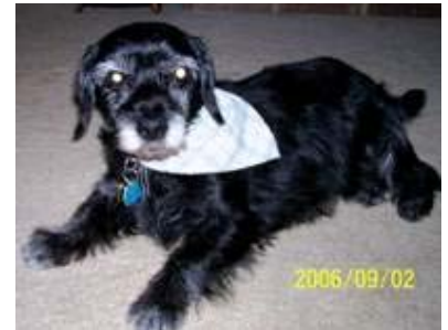
MR. "B" #252